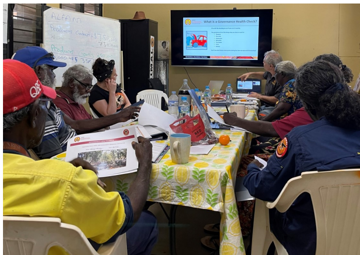
Developing tools with Mimal Land Management to help improve financial literacy and understanding of the Money Story

Mimal's dedicated 'two-way' approach means they are combining ancient cultural practice with a contemporary scientific approach to land management.