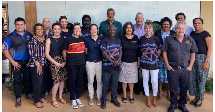
AGMP is proud to be a part of the APO NT alliance who speak up for Aboriginal people across the NT

AGMP is proud to be a part of the Aboriginal Peak Organisations Northern Territory (APO NT) alliance, who represent Aboriginal community-controlled peak bodies, organisations and Land Councils from across the Territory. This year APO NT have been busy working with Federal and NT Governments on Closing the Gap Implementation Plans.