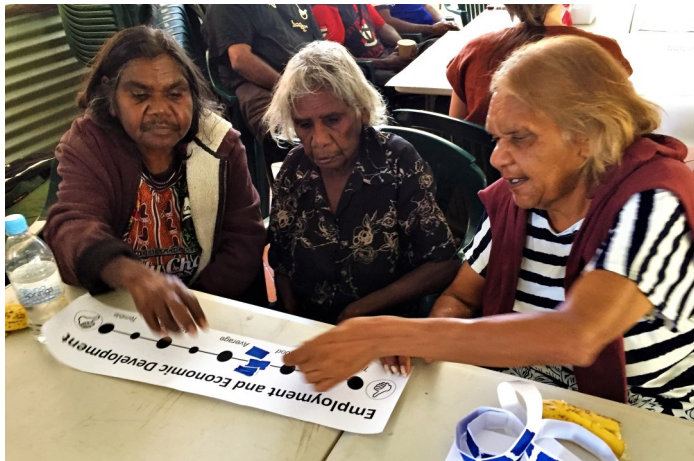
Traditional Owners gathered feedback on different aspects of Joint Management for the NT Parks and Wildlife Commission

Traditional Owners came together to learn and share stories about how Joint Management works. In between storm showers we also found time to reflect on the Joint Management partnership with NT Parks.