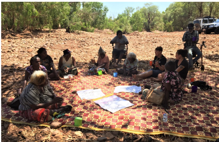
Governance and planning workshop with staff and members of Karungkarni Art and Culture in October

Karungkarni Art and Culture is a vitally important organisation to the people of Kalkaringi and Daguragu communities.