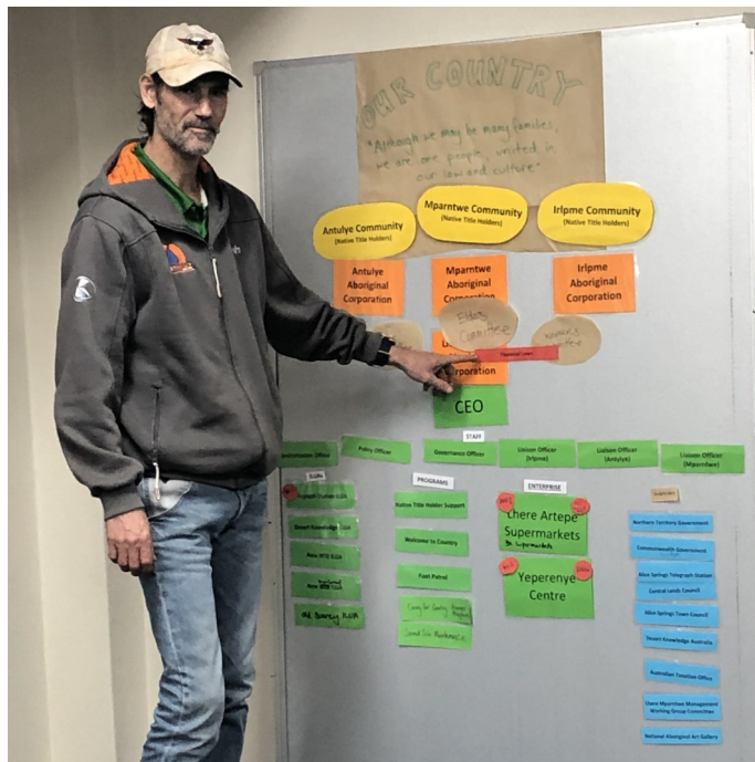
Making a governance 'map' helps understand the structure and relationships within an organisation

This involves helping directors build knowledge of their legal role and responsibilities as decision-makers for the organisation. We have begun by supporting directors to create a Lhere Artepe governance 'map'. This has helped everyone to better understand the structure of the organisation – including how the various estate groups and corporate business entities all fit together. Knowing the relationships between the different parts and activities of an organisation is key to accountability and good governance.