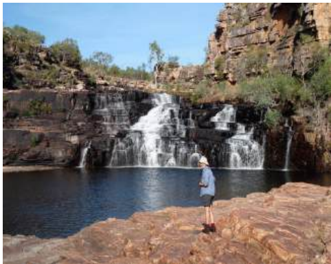
Getting ready for a swim at Amphitheatre Falls.

This section overlaps the first and includes the night at Cooinda, the Animal Tracks tour and the Yellow Waters cruise. After the cruise we bid farewell to anyone not continuing and drive to the Jim Jim car park. The drive is less than 100 kilometres but may take up to two hours depending on the condition of the gravel road and 4WD tracks. If the track to Twin Falls is not yet open, we will walk from the Jim Jim car park, then climb up and camp at the top of Twin Falls. The extra walk