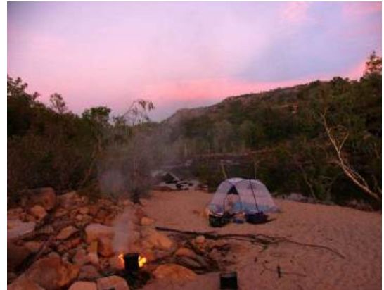
Sunset, Koolpin camp

Summary. This trip consists of two separate walks either of which can be done on its own. Lots of waterfalls, lots of swimming and a chance to see Twin Falls at a time when it is likely to be closed to the general public. You spend a night at Cooinda and, if available, do the Animal Tracks tour and a Yellow Waters cruise between walks.