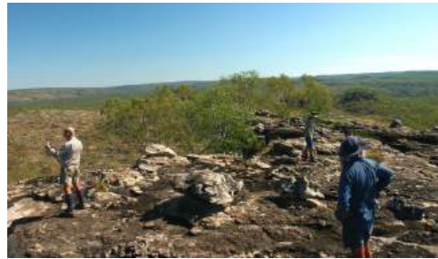
View from the top

Back on the plain, we continue up and over a low pass and back to Koolpin Creek where we camp near the cascades shown at right. From there we follow Koolpin back down past our second campsite to where the creek does a sharp bend. We camp on a sandy area near the bend.