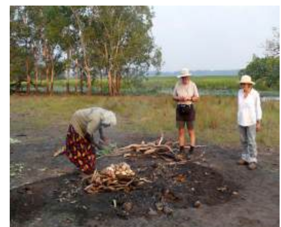
Getting ready to open the ground oven, Animal Tracks tour

Day 7 Those beginning with this section catch a bus from Darwin to Cooinda early in the morning. The cost of getting to Cooinda is not included in the cost of the tour. On arrival, you can wait in the open air pub and meet the group there or check into the campground and set yourself up. Due to the fact that the members of the group are finishing a walk that morning, we cannot be more specific about the arrival time than to say it will be about lunch time. Animal Tracks tour begins at 1 PM and goes late. Includes food. Make sure you bring towel and toiletries and money for drinks.