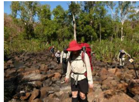
Crossing Koolpin Creek on the marked trail at the start of section one