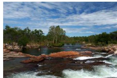
Upper Koolpin cascades

Back on the plain, we continue up and over a low pass and back to Koolpin Creek where we camp near the cascades shown at right. From there we follow Koolpin back down past our second campsite to where the creek does a sharp bend. We camp on a sandy area near the bend.