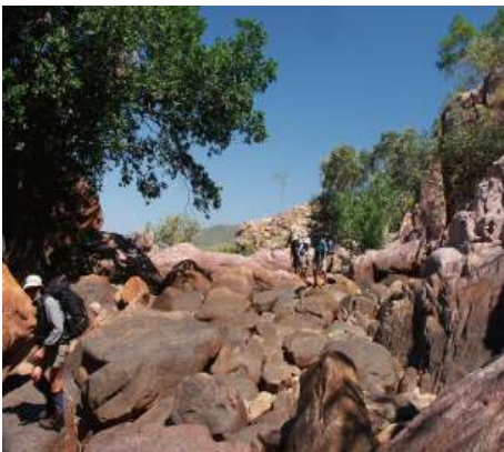
Rock hopping up lower Freezing Creek. Some of the rocks are larger than these.

the creek. You need to be prepared for a short pack float as the alternative to a 30 metre swim is an hour or two of strenuous rock climbing. (You can waterproof your pack by lining it with 2 garbage bags, one inside the other, and sealing them carefully.)