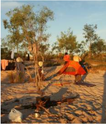
Sunset, Jim Jim campsite.

The day we leave Twin Falls Creek is potentially the tough one. We head overland to the top of a rainforest filled gorge, known as Anbadjgoran to the local Aboriginal people. Along the way, we pass through some very rugged and broken sandstone country — so rugged that no two groups have ever picked the exact same route. Depending on how much time we spend working our way through the sandstone maze, we may camp on one of the creeks we cross en route or we may reach the gorge.