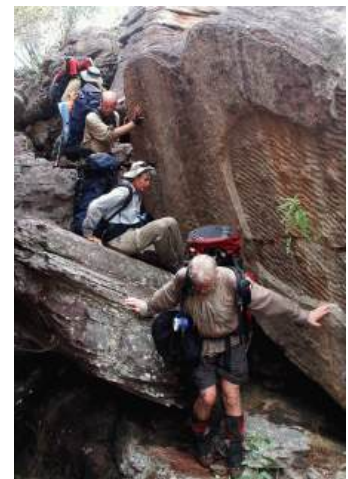
Rock scramble en route from Twin Falls to Anbadgoran