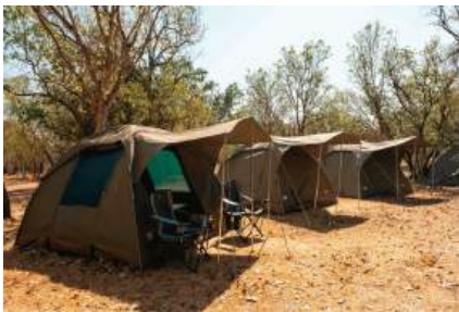
Pop up tents at Cooinda

The Yellow Waters cruise provides the best way to see the wetlands and allows you approach the wildlife (especially birds and crocodiles) much closer than you could do on foot. The cultural centre is a few hundred metres from the hotel and provides an insight into the lives of the Aboriginal traditional owners of the park. The nature walk offers a pleasant way to spend an hour or two, especially early in the morning or late afternoon.