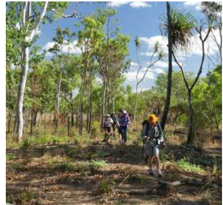
Walking through open woodland

Anyone who does not regularly (average twice a month) go bushwalking carrying a full pack would benefit from doing some pre-trip training. Do this and you will almost certainly enjoy the trip. If you are not an experienced off-track bushwalker and you don't do any training or any other form of strenuous physical exercise, you might feel that the trip is more of an endurance test than the pleasure most people experience.