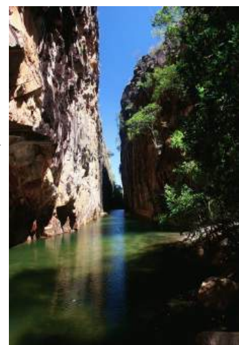
Looking back through Freezing Gorge

The walk down Freezing Creek below the gorge involves climbing over and scrambling around large boulders. A distance of about a kilometre may take two hours. Although we do not rate this walk as difficult, the one km walk down Freezing Creek below the gorge can be a daunting experience for some people. People who have never done anything like this before may find it difficult. Progress down the creek may be quite slow. We plan to camp near the bottom.