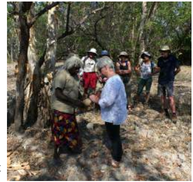
On the Animal Tracks tour

This section finishes with the 6.45 a.m. Yellow Waters Cruise the following morning. The cruise gives you the opportunity to see the wetlands wildlife at close range, far closer than you could on foot.