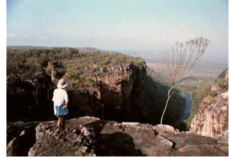
View from the top of Jim Jim Falls. This spot is less than 200 metres from the campsite pictured at left.

The day we leave Twin Falls Creek is potentially the tough one. We head overland to the top of a rainforest filled gorge, known as Anbadjgoran to the local Aboriginal people. Along the way, we pass through some very rugged and broken sandstone country — so rugged that no two groups have ever picked the exact same route. Depending on how much time we spend working our way through the sandstone maze, we may camp on one of the creeks we cross en route or we may reach the gorge.