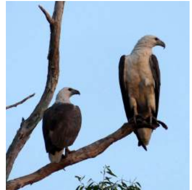
White breasted sea eagles seen on the Yellow Waters cruise

The cultural centre and the hotel sell a variety of souvenirs. Bring extra cash or a credit card if you think that you might wish to purchase anything beyond the drinks, ice creams and lunches that most people buy there.