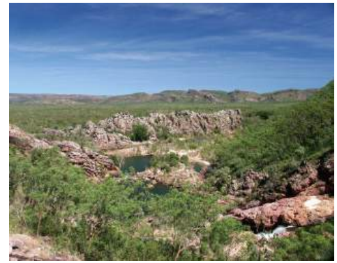
Looking back from above the first falls, Koolpin Gorge.

From here, we head approximately east to the base of a tall hill. We drop our packs and climb to the top where we enjoy a magnificent view in all directions. The climb is relatively easy with a cool sort of labyrinth just below the top.