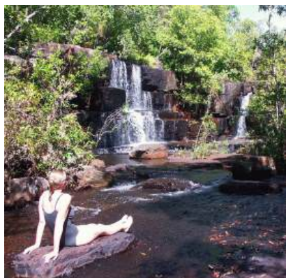
Relaxing below Anbadgoran Falls

The walk from the Twin Falls car park to the top follows a marked trail up a fairly steep hill, through an interesting sandstone maze and out to the creek above Twin Falls. We must stay on this trail until we leave the restricted area about two km above the falls.