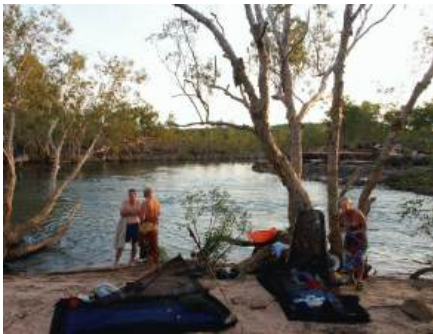
Upper Koolpin campsite.

Koolpin Gorge is beautiful. The pools are perfect for swimming, the waterfalls and views a photographers delight. Aboriginal art sites tell us that this has been a special place for thousands of years. It's such a special place that it normally takes us two days to get to the campsite shown below, less than 8 km from where we began.