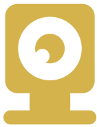
Photo Booth Sponsor ($1,500)