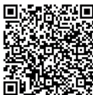
Pew Rally QR Code

PEW RALLY Support the continuing restoration effort by adopting a pew. Here is your chance to assist in the restoration of our church and commemorate someone special in your life. Your donation of $1,500 will cover the cost of refinishing a pew. A memorial plaque will be placed on each adopted pew recognizing your gift. The adoption gift can be made in 1, 2 or 3 payments and can be split by two donors. Begin your adoption gift by scanning the QR code or following the email address listed in the bulletin. Thank you for considering a gift to restore our church to its original luster.