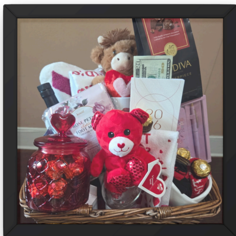
Valentine's Day Basket Raffle

PEW RALLY Support the continuing restoration effort by adopting a pew. Here is your chance to assist in the restoration of our church and commemorate someone special in your life. Your donation of $1,500 will cover the cost of refinishing a pew. A memorial plaque will be placed on each adopted pew recognizing your gift. The adoption gift can be made in 1, 2 or 3 payments and can be split by two donors. Begin your adoption gift by scanning the QR code or following the email address listed in the bulletin. Thank you for considering a gift to restore our church to its original luster.