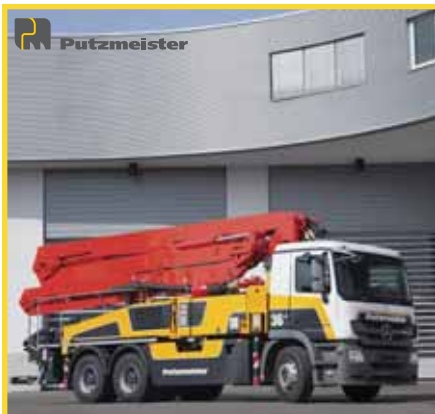
Truck-Mounted Concrete Pumps