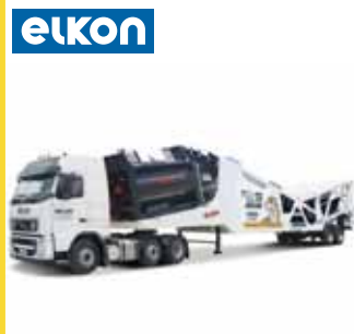
Mobile Concrete Plants