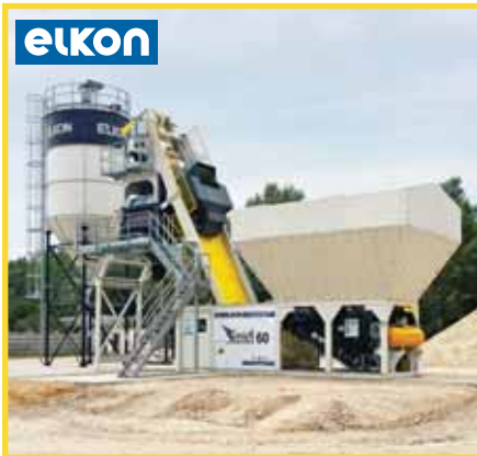
Compact Concrete Plants