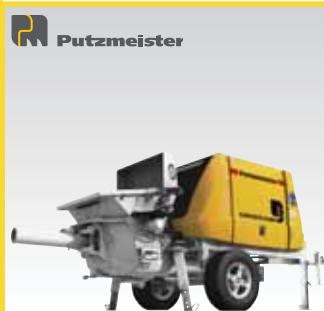
Stationary Concrete Pumps