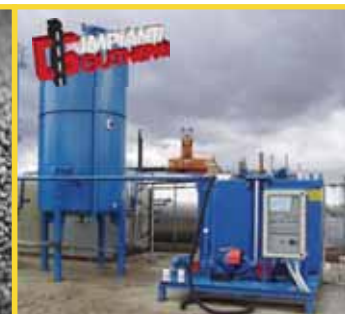
Bitumen Emulsion Plants