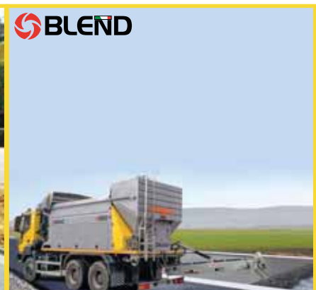
Continuous cold asphalt