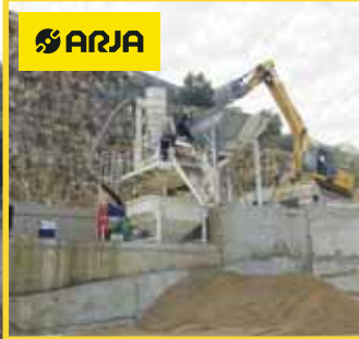
Sand Washing Systems