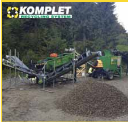
Dry Concrete Recycling Systems