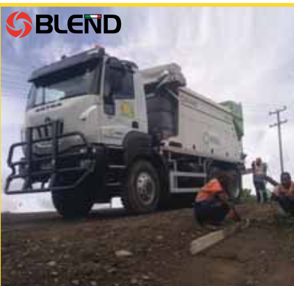
Mobile continuous concrete mixing