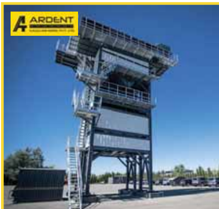
Stationary Asphalt Mixing Plants