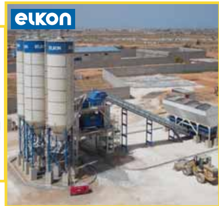
Stationary Concrete Plants