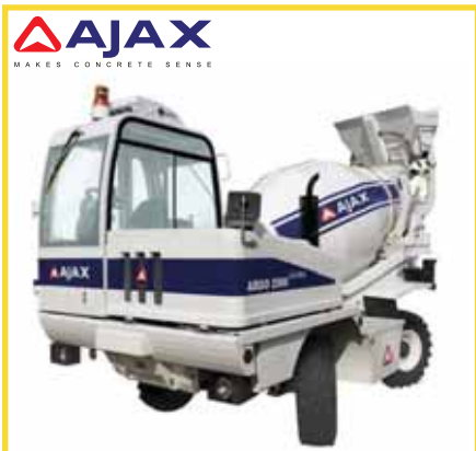
Self Loading Concrete Mixer