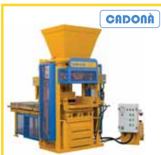
Stationary Block and Interlocks Making Machines