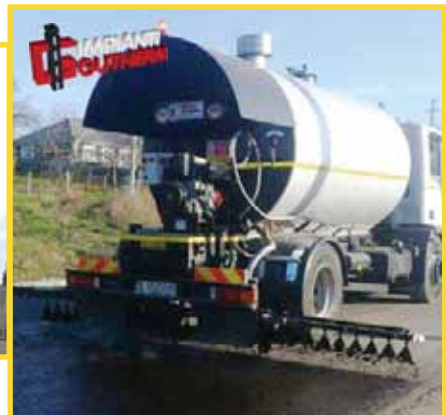
Bitumen Spraying Machines