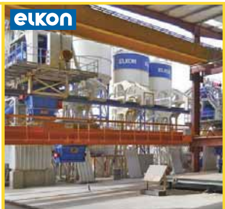
Precast Batching Plants