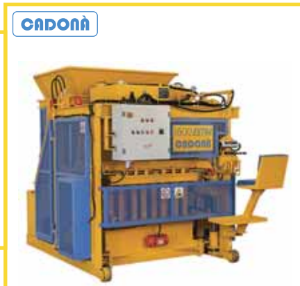
Mobile Block and Interlocks Making Machines