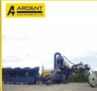
Mobile Asphalt Mixing Plants