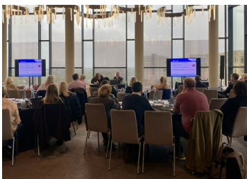
Waste Management BVG in Birmingham

Across June and July, a total of fifteen NPAG meetings took place, reflecting vibrant and engaged networks. Meetings were well attended and demonstrate the commitment of our members. In several