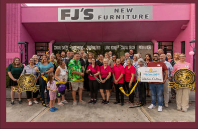
FJ's Furniture and More - Ribbon Cutting Charlotte County Chamber of Commerce December 2, 2025