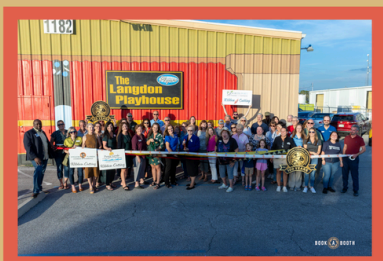
Charlotte Players, Inc. - Ribbon Cutting Charlotte County Chamber of Commerce November 25, 2025