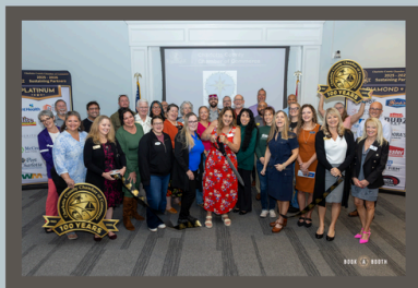
Southern Cross Campus, Inc. - Ribbon Cutting Charlotte County Chamber of Commerce November 19, 2025