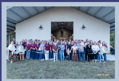
Eirene Ranch, Inc. - Ribbon Cutting Charlotte County Chamber of Commerce November 19, 2025