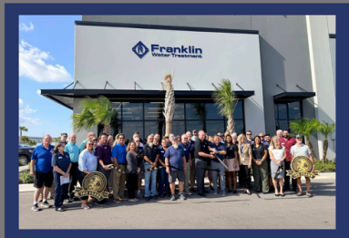
Franklin Water Treatment - Ribbon Cutting Charlotte County Chamber of Commerce November 19, 2025