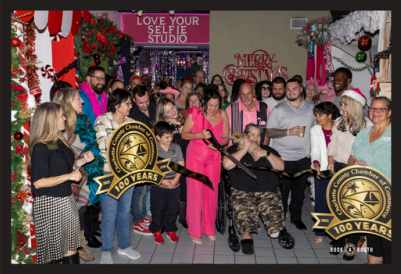
Love Your SELFie Studio - Ribbon Cutting Charlotte County Chamber of Commerce December 16, 2025