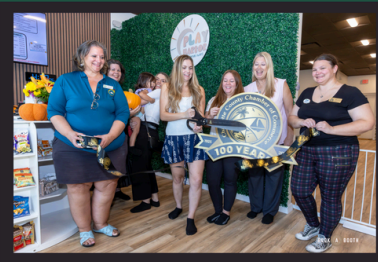
Play Harbor, LLC - Ribbon Cutting Charlotte County Chamber of Commerce November 4, 2025