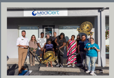
MediCert Pro Lab - Ribbon Cutting Charlotte County Chamber of Commerce October 16, 2025