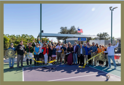
PicklePlex of Punta Gorda - Ribbon Cutting Charlotte County Chamber of Commerce December 16, 2025