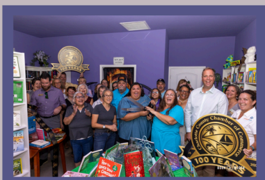
The Bookdragon's Lair - Ribbon Cutting Charlotte County Chamber of Commerce October 9, 2025