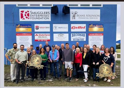
Leadership Charlotte Class of 2020 - Press Box Dedication Charlotte County Chamber of Commerce December 9, 2025