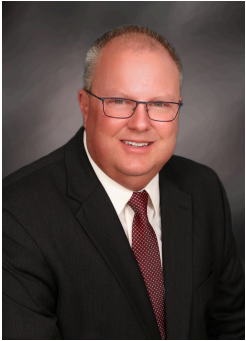
Punta Gorda Airport

Service from Allegiant and Sun Country brought PGD record-breaking passenger numbers nearing 2.3 million in 2025. Allegiant also announced new routes to both Trenton and Atlantic City, NJ starting in February 2026, and Sun Country returned with seasonal flights to Minneapolis, MN through April. Allegiant launched a new seasonal route to New Orleans, and brought back seasonal routes to Chattanooga, TN, St. Cloud, MN , Sioux Falls, SD , Plattsburgh and Elmira, NY .