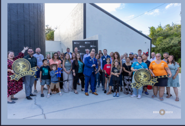
Ideal Retirement Solutions - Ribbon Cutting Charlotte County Chamber of Commerce October 28, 2025