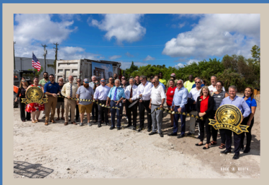
Dion Development - Ribbon Cutting Charlotte County Chamber of Commerce October 7, 2025