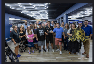
The Sunshine Carts - Ribbon Cutting Charlotte County Chamber of Commerce November 6, 2025