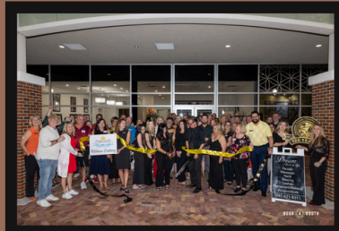
Dream Salon & Spa, LLC - Ribbon Cutting Charlotte County Chamber of Commerce November 18, 2025