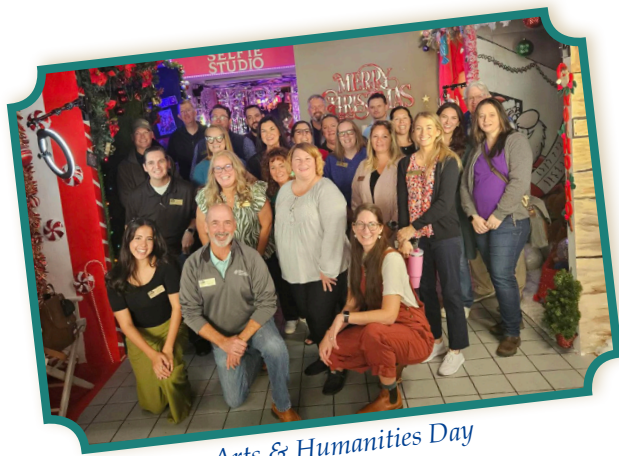
Arts & Humanities Day

"Leadership Charlotte has been a wonderful learning and team-building experience. It combines opportunities to learn about the many facets of our community, network with new people, build lasting friendships, and work together to raise funds for organizations that make a difference in Charlotte County. I have met and grown to know so many wonderful people over the last 10 months. What began as a group of classmates quickly became a network of friends, colleagues, and community leaders who share a passion for making our community stronger. The relationships, experiences, and insights I've gained through this program will stay with me long after graduation, and I am grateful to have been part of such an inspiring class."