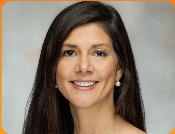
AMY PROVINCE YMCA of the Capital Area